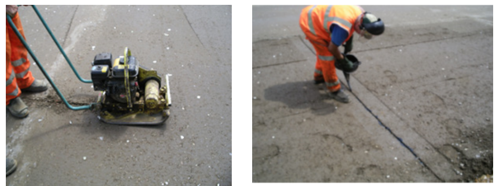
Figure 3: Induced cracks (left) and filling the grooves (right) of CBM

While the tendency is to produce low strength CBMs to minimize the risk of reflection cracks in the asphalt overlay, there is a need to provide consistent strength and uniform support to the pavement across its whole length. The UK Specification for Highway Works (Highways England, 2016), Volume 1, Series 800 specifies induced cracks for all HBMs that are expected to reach a compressive strength of 10 MPa at 7 days. Transverse cracks are induced in the fresh CBM/HBM by grooving the layer between ½ to 2/3 of its thickness, and filling the grooves with a bitumen emulsion before final compaction (Figure 3). The transverse cracks will not prevent the CBM from shrinkage and thermal movements, but will accommodate them to minimize the effect of reflection cracking. The technology is relatively cheap, has been successfully used in the UK, and could be implemented in the following revisions of the QCS.