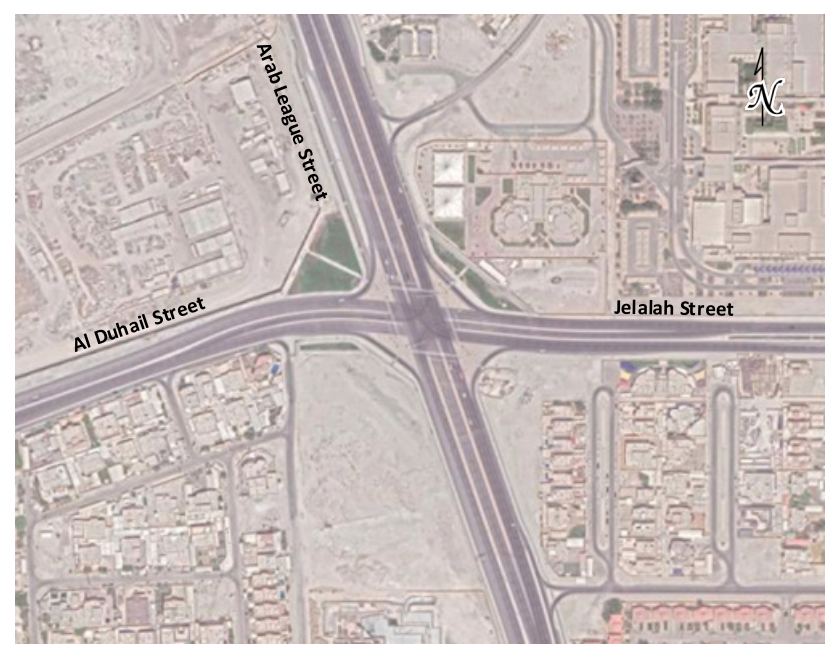
Figure 1: Aerial Image Showing the Study Intersection