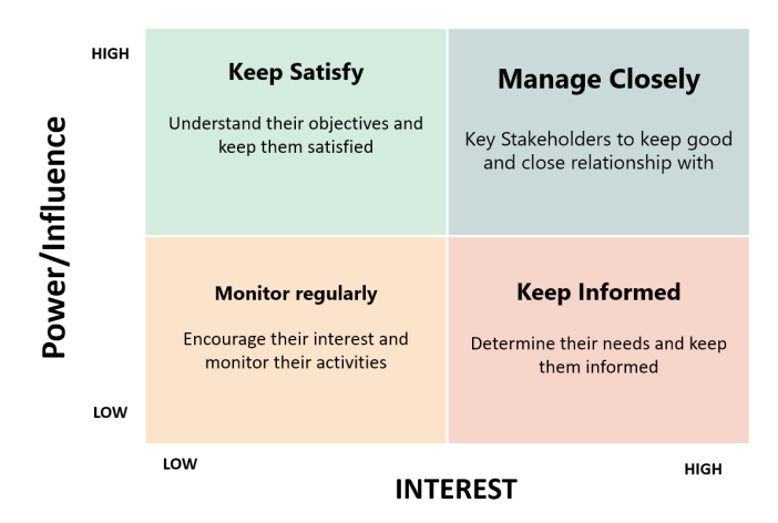
Figure 1: 2x2 Analysis Grid (Power/Influence vs. Interest) (Mendelow, 1981)